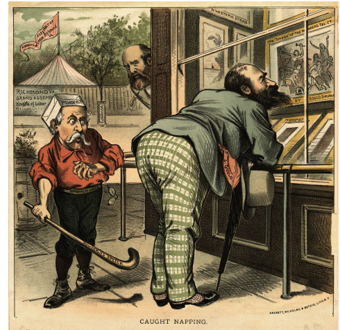
Knights of Labor leader Terence Powderly takes on railroad monopolist Jay Gould as labor economist Henry George looks on.

Attacked by Conservatives for Embracing Violence, and by Anarchists for Rejecting Violence