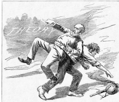
Harper's Weekly ties George's pro-labor theories to anarchist violence.