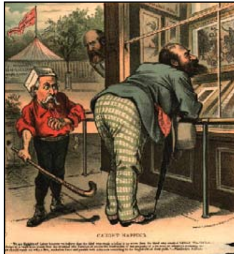
Judge , 1886: As Henry George looks on, Terence Powderly prepares to swat Jay Gould, who is gazing at his monopolies.

Caption: CAUGHT NAPPING "We are Knights of Labor because we believe the thief who steals a dollar is no worse than the thief who steals a railroad... and the law should reach out with a firm, unshaken hand and punish both criminals according to the magnitude of their crime." — Powderly's Address